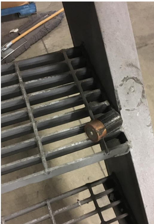
Even Worse – Loose Material on Stairs