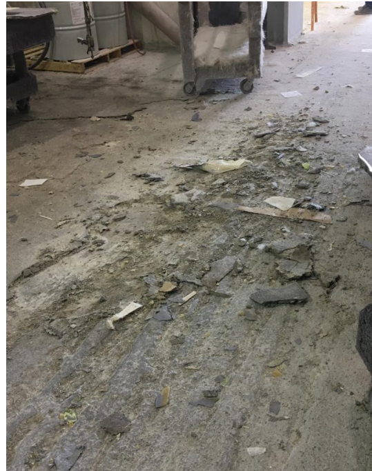
Loose Material on Floor