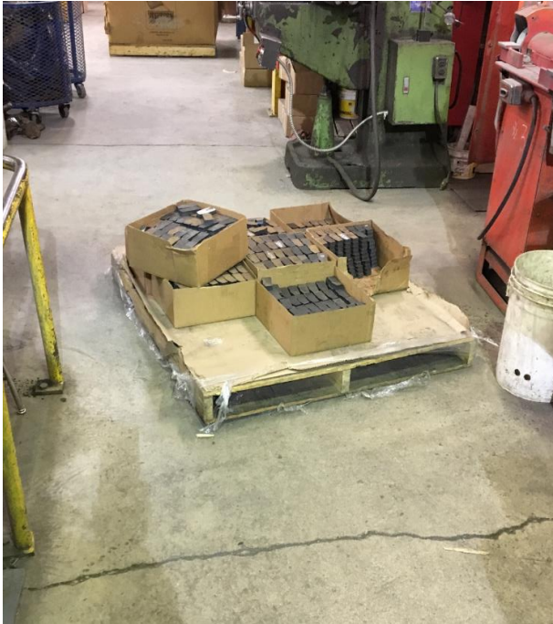
General Clutter you have to walk around